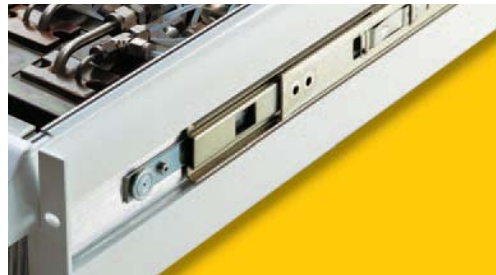
The CLD 822 S hr with slides is perfectly prepared for rack mounting

The concept with two parallel reaction chambers allows the simultaneous measurement of NO and NO x in order to generate the precise value of NO 2 .