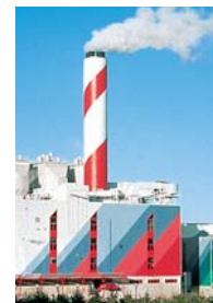
Waste incineration plants.