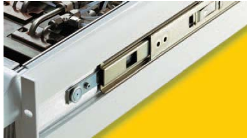
The CLD 82 with slides is perfectly prepared for rack mounting.

Many more applications are available as options or upgrades at a later date.