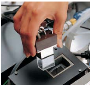
Modularity means easy maintenance.

The design is remarkably compact. All components, even the vacuum pump and the thermal ozone scrubber, are contained in one single unit. In spite of its simple construction the high ECO PHYSICS standard is fully complied with. The instrument includes a temperature stabilized photo multiplier and a high performance ozone generator.