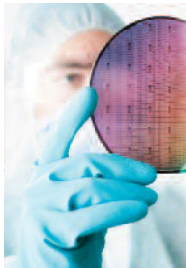
Clean room laboratories require reliable and precise gas analysis.

The CLD 88 nitrogen oxide analyzer is unique in its speed and precision. It makes possible the continuous measurement of NO concentrations even in the range of parts per trillion!