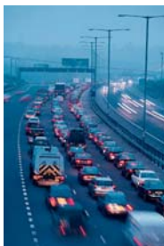
Outdoor NO 2 and NO x monitoring.

The new CLD 64 nitrogen oxide analyzer is the economical solution for the continuous measurement of NO, NO 2 and NO x concentrations even in the low parts per billion!