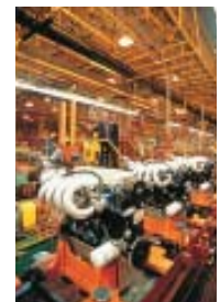
Quality controls in production processes.

The CLD 64 is the most compact unit of its class. Thanks to the totally modular layout and integrated ozone generator and scrubber it is designed for a multitude of applications.