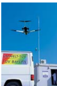
Mobile measurement stations.

Either integrated into entire production processes and systems, or as stand-alone devices in monitoring stations, they continuously deliver the exact NO, NO 2 and NO x values you require. The design of the instrument is optimized for rack mount and stand-alone applications.