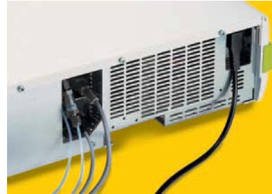
All external connections are hidden but easily accessible from the rear.

Many more applications are available as options or upgrades at a later date.