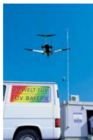
Monitoring of ambient air quality.

The photolytic converter PLC 860 is capable to converting selectively NO 2 in concentrations of a few ppt. This instrument is the right choice for areas with excellent air quality.